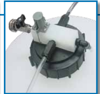
40 Gallon Gemini Level Master