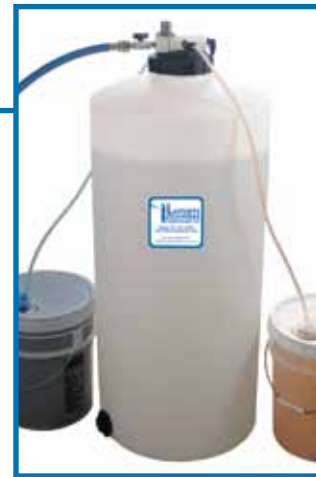
40 Gallon Gemini Level Master